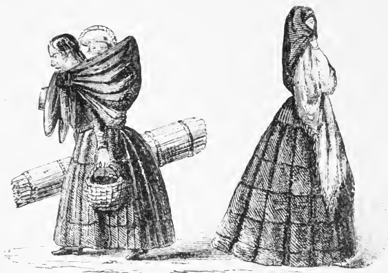
CHILIAN INDIAN MOTHER.